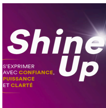
Keynote speech Shine Up 2024