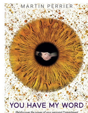
YOU HAVE MY WORD Self-published book