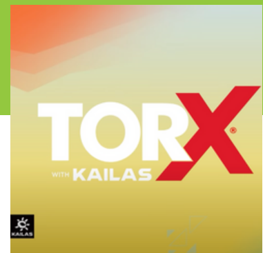
Post-race interview Tor Des Géants 2024