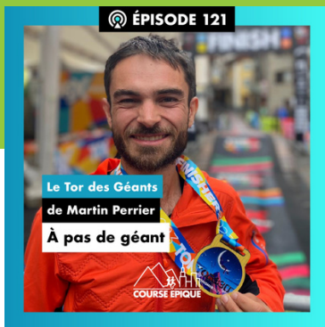
Podcast Interview Course Epique

In addition to my engaged social media following and the content we co-create, your brand benefits from consistent media exposure across general and specialized outlets — locally, nationally, and internationally. From print and magazines to TV and digital platforms, your message reaches far beyond the trail.