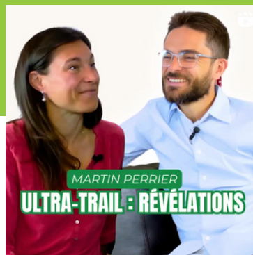
Podcast Interview Parcours Inspirants