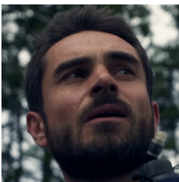
Instagram Reel Kailas FUGA Team